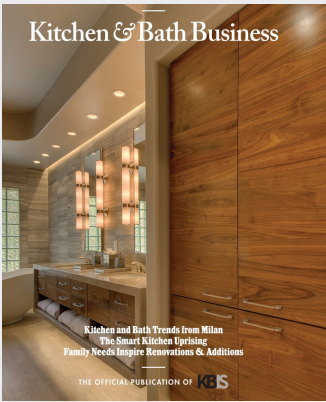
Circulation By Issue

Qualified recipients are owners/partners, company executives including president/CEO/VP, manager/ directors, buyers and other related to the field.